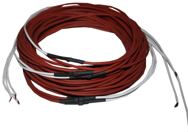
RESISTENZA IN FIBRA DI VETRO HEATING CABLES WITH GLASS FIBRE SHEATH