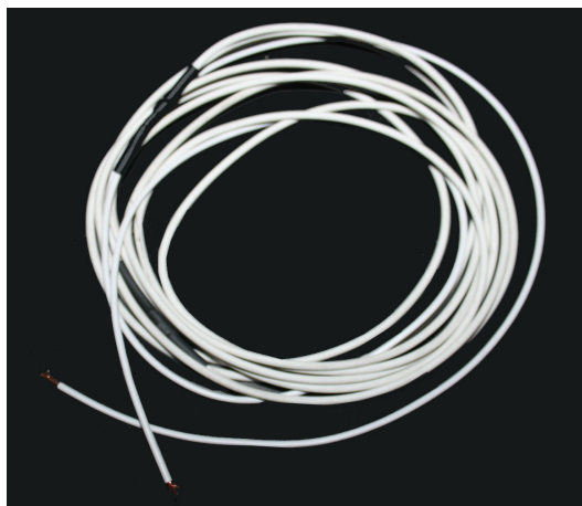
RESISTENZA IN SILICONE HEATING CABLES WITH SILICON SHEATH