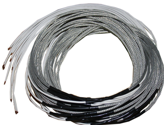
RESISTENZA IN CALZA INOX HEATING CABLES WITH METALLIC COATING